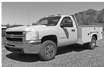
'08 Chevy Silverado 3500HD, 6.6L Duramax dsl., Allison auto., 9' Knapheide service bed, 186,000 miles, $12,900.