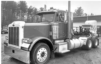
'02 Pete 379 short hood, day cab, glider kit, 12.7 Det., 13 spd., 220" WB, $39,900.