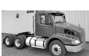
'99 Volvo VNL64T tdm. axle day cab, Det. Series 60, 9 spd., A/C, air ride, $13,900.