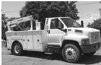
'05 Chevy C7500, C7 Cat, 6 spd., Autocrane, hyd. compressor, Miller welder/generator, hyd. outriggers, under CDL, $49,900.