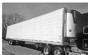
'06 Utility 53'x102" reefer, '08 Carrier 2100A, 18" scuffband, (2) rows E-track, 22.5 tires, alum. whls., $16,900.