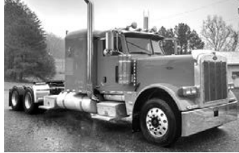
'06 Pete 379 ext. hood, 48" flat top slpr., 475 Cat, 18 spd., 450,000 miles, $74,900.