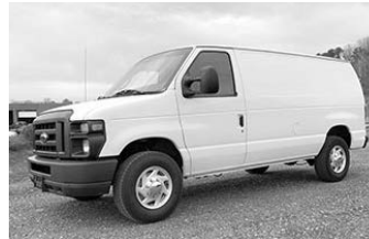
'12 Ford Econoline E250 cargo van, 4.6L gas, 8 cyl., 174,200 miles, $9,900.