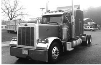
'03 Pete 379 ext. hood, 63" stand up slpr., C15/6NZ Cat, 475 hp, 10 spd, 260" WB, $39,900.