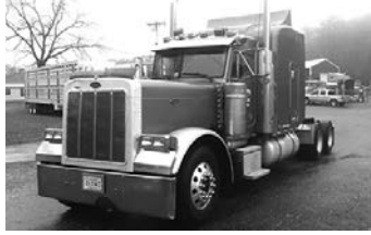
'03 Pete 379 ext. hood, 63" stand up slpr., C15/6NZ Cat, 475 hp, 10 spd, 260" WB, $39,900.