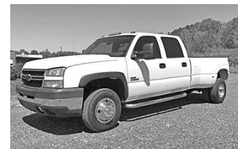
'06 Chevy Silverado 3500, 6.6L Duramax dsl., Allison auto., 4WD, DRW, 152,000 miles, $18,900.