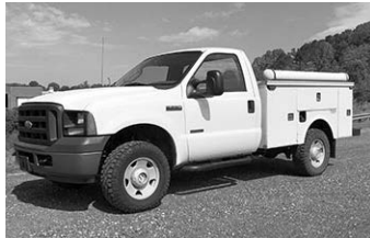
'07 Ford F250SD, 4WD, 6.0L dsl., 8' Omaha service bed, 144,000 miles, $13,900.