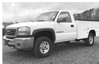
'05 & '06 GMC Sierra 2500HD, 6.0L gas, auto., 8' service bed, 108,000 & 144,000 miles, starting at $10,900.