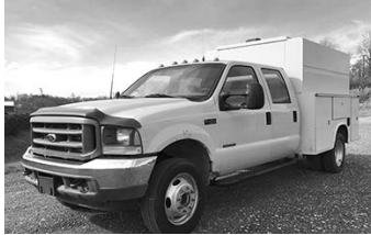
'01 Ford F450, 7.3L turbo dsl., 8-cyl., auto., electrician body, 189,000 miles, $11,900.