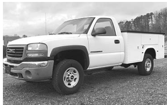
'05 GMC Sierra 2500HD, 6.0L gas, auto., 8' Knapheide service bed, 144,000 miles, $11,900.