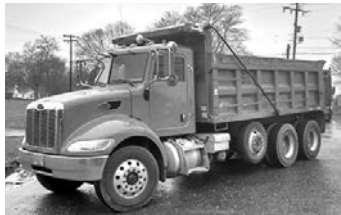
'06 Pete 335 dump truck, tri-axle, steerable, 8.3 300 hp Cum. 8LL, 16' bed w/barn gate, $59,900.