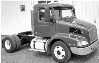
'00 Volvo VNL62T S/A, Det. Series 60, 9 spd., A/C, air ride, great miles, $8,900.