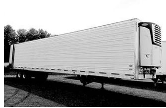
'05 Utility 53'x102" reefer, w/Carrier 2100 unit, air ride, swg. doors, alum. whls., $16,900.