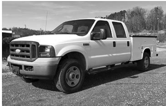
'06 Ford F350SD, 5.4L 8 cyl. gas, auto., 4WD, 8' Knapheide service bed, fleet maintained, 168,000 miles, $13,900.