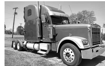
(2) '07 FTL Classic XL, 70" condo, 14L Det., 600 hp, 10 spd., alum. whls., LP 22.5 tires, 360,000 miles on in-frame, $39,900.