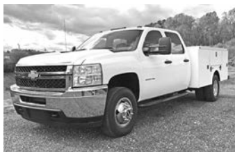
'12 Chevy Silverado 3500HD, 4WD, 6.6L Duramax dsl., Allison auto., 9' Omaha service bed, pwr. windows & locks, 134,000 miles, $30,900.