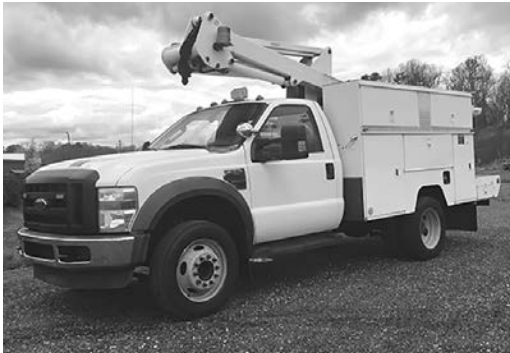
(2) '08 Ford F550SD, 6.4L turbo dsl., auto., 40' work ht. bucket trucks, (1) ETI & (1) Altec, starting at $23,900.