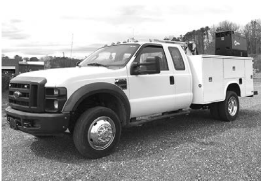
'08 Ford F450SD, 6.4L turbo dsl., deleted & tuned, 4WD, Auto Crane, new Miller Bobcat 225 welder/gen., new IR 2475 comp., hose reel, 151,000 miles, $35,900.