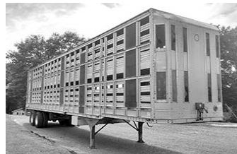
'06 Barrett 50'x102" alum. hog trlr., (2) levels w/3-cut gates, cold weather pkg., watering system, air ride, $19,900.