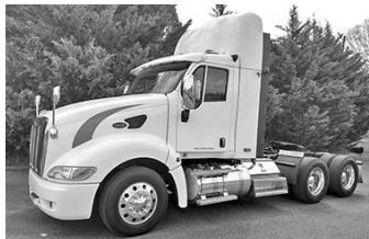
'11 Pete 387 day cab, Cum. ISX, 450,000 miles, 10 spd., tool boxes, (10) alum. whls., $39,900.