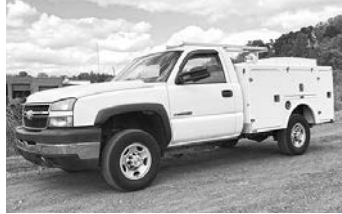
'07 Chevy Silverado 2500HD, 4WD, 6.0L 8-cyl. gas, auto., brand FX fiberglass service bed, new tires, 133,000 miles, $14,900.