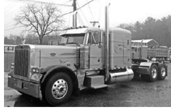
'03 Pete ext. hood, 63" flat top slpr., 475 hp 6NZ Cat, 15 spd., 260" WB, $54,900.