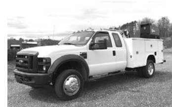
'08 Ford F450SD, 6.4L turbo dsl., deleted & tuned, 4WD, Auto Crane, new Miller Bobcat 225 welder/gen., new IR 2475 comp., hose reel, 151,000 miles, $35,900.