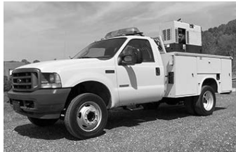
'04 Ford F450SD, 6.0L dsl., Stahl 3200 LRX crane, Miller Bobcat 225 welder/generator, air compressor, 52,000 miles, $20,900.