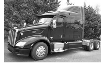
'13 Pete 587, Paccar MX, 13 spd., dbl. bunk, refrigerator, (10) alum. whls., 487,000 miles, $29,900.