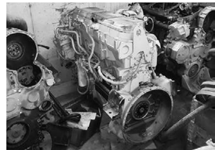
'03 Cat C12 engine, w/Jake brake, $4,000.