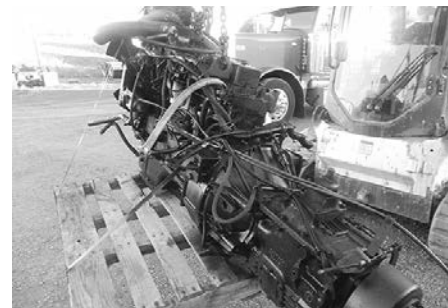
Cummins 12-valve engine, w/6 spd. trans., 60,000 miles, $2,000.