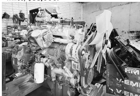
'04 Cat C15 engine, w/Jake brake, 700,000 miles, $6,500.