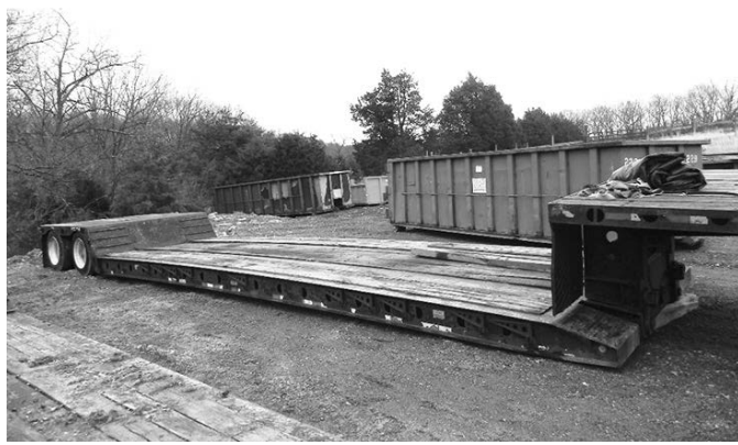
'99 Dynaweld dbl. drop trlr., 29' well w/10' top deck, new 255/70R22.5 tires, $18,000.