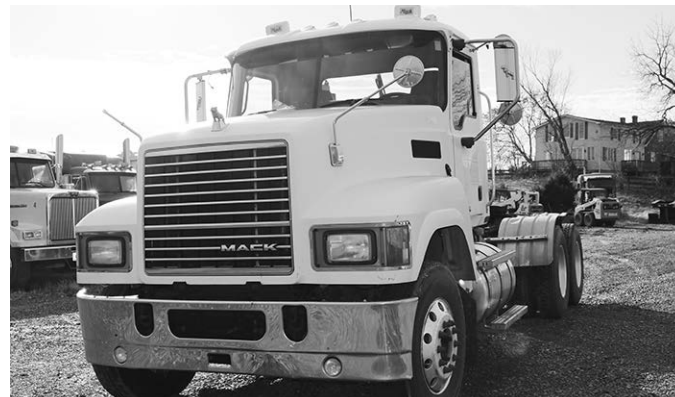
'08 Mack DHU613, day cab, VIN 1M1AN09Y78N002096, $20,000.