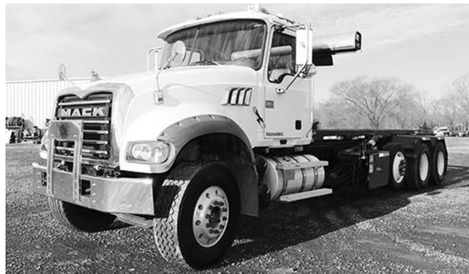
'07 Mack roll-off, tri-axle, MP7, 8LL trans., 60,000# Galbreath hoist, Donovan HiTower tarp, 440,783 miles, $68,000.