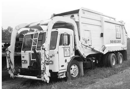
'04 Pete 320 Durapack 312-2800 Half Pack garbage truck, Cat motor, Allison auto., $38,000.