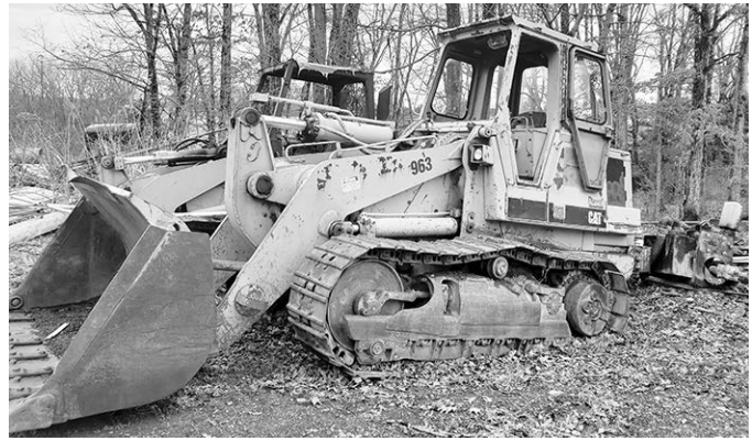
Cat 963 , S/N 48200159, does not run, will not start, for parts only?, $6,000.