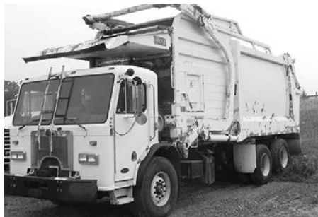
'05 Pete 320 Durapack 312-2800 Half Pack garbage truck, Cum. turbo dsl., 305 hp, Allison auto. 6 spd., 181,253 miles, $38,000.