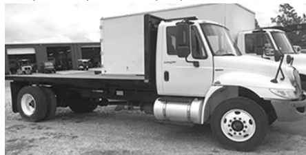
'11 Int'l. 4300, DT466 dsl., 245 hp, auto. O.D., air ride susp., SA, eng. brake, 5.29 ratio, 22.5 tires, steel whls., 226" WB, 33,000 GVW, 12F, 21R, 16"x102", 180,000 miles, stk. #2937-T, $38,900.