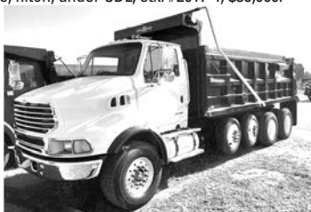
'05 Sterling LT9513, 450,000 miles, Mercedes MBE4000, 450 hp, 10 spd. O.D., dsl., TufTrac susp., quad axle, comoleptely redone new 18" steel dump w/high lift tailgate, stk. #2617-T, $65,900.