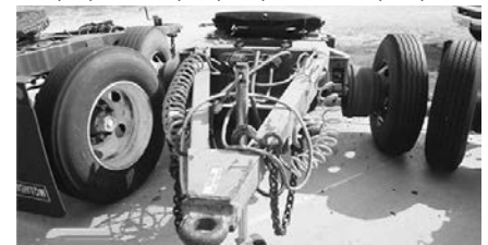
(3) '04 Stoughton dolly, 22.5 tires, S/A, steel composition, spg. susp., fixed axle, fixed neck, good working dolly, tires avg., $1,500.