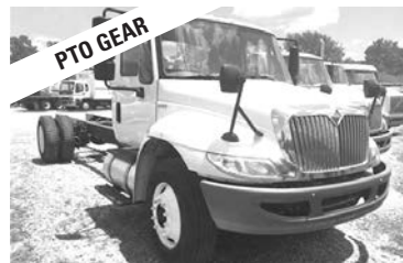
'11 Int'l. 4300, Int'l. DT466 dsl., 245 hp, auto. O.D., air ride susp., S/A, eng. brake, 5.29 ratio, 22.5 tires, steel whls., 226" WB, 33,000 GVW, 12F, 21R, std. cab, 185,000 miles, stk. #2925-T, $25,900.