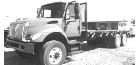
'06 Int'l. 7400, Int'l. DT570 dsl., 310 hp, 188,000 miles, auto. O.D., air ride susp., tdm., 22.5 tires, steel whls., 265" WB, 56,000 GVW, 16F, 40R, std. cab, 24"x102" body, Moffitt forklift kit, stk. #2886-T, $49,900.