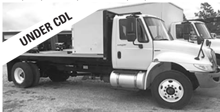
'11 Int'l. 4300, DT466 dsl., 245 hp, auto. O.D., air ride susp., SA, eng. brake, 5.29 ratio, 22.5 tires, steel whls., 226" WB, 33,000 GVW, 12F, 21R, 16'x102", 180,000 miles, stk. #2937-T, $38,900.