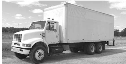
'03 Int'l. 8100, Cat C10 dsl., 305 hp, 10 spd. O.D., spg. susp., tdm., 22.5 tires, steel whls., 52,000 GVW, 12F, 40R, 24', R.U. door, stk. #2926-T, $14,900.