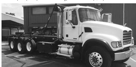
'06 Mack Granite CV713, 550,000 miles, Mack AMI dsl., 350 hp, 8LL O.D., 4.64 ratio, camelback susp., tri-axle, 22.5 tires, alum./steel whls., 76,000 GVW, 18F, 44R, good A/C, stk. #3001-T, $65,900.