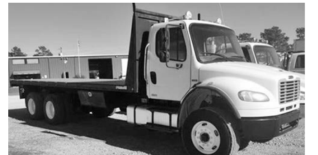
'05 FTL Business Class M2 106, Mercedes MB900 dsl., 300 hp, 8LL O.D., TufTrac susp., tdm., 3.91 ratio, 22.5 tires, steel whls., 260" WB, 18F, 46R, 24"x102" flatbed, stk. #2939-T, $39,500.