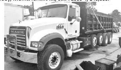
'08 Mack Granite GU713, Mack MP7 dsl., 405 hp, 8LL O.D. trans., quad-axle, camelback susp., eng brake, 24.5 tires, alum whls., 280" WB, 86,000 GVW, 18F, 44R, 19' body, stk. #2914-T, $78,900.