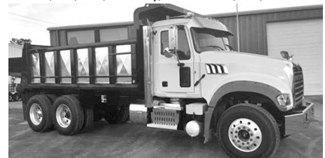
'15 Mack Granite GU713, Mack MP7 dsl., 415 hp, auto., camelback susp., tdm., eng. brake, 4.50 ratio, 22.5 tires, alum. whls., 216" WB, 62,000 GVW, 18F, 44R, 15' dump, stk. #2874-T, $110,900.