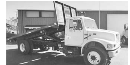
'95 Int'l. 4900, Int'l. DT466 dsl., 210 hp, 400,000 miles, 6+1 spd., spg. susp., S/A, 22.5 tires, steel whls., 124" WB, 33,000 GVW, 12F, 21R, 16'x96" body, stk. #2959-T, $13,900.