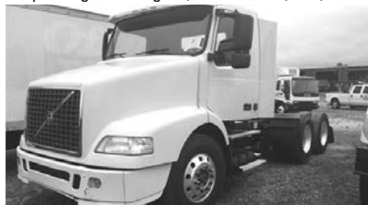
'06 Volvo VNM64T200, Volvo VED12 dsl., 395 hp, 10 spd. O.D., air ride susp., tdm., eng brake, 4.11 ratio, 22.5 tires, alum. whls., 175" WB, 12F, 40R, stk. #2946-T, $24,900.