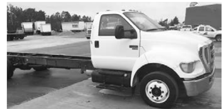
'06 Ford F650 XL SD, 104,000 miles, Ford 6.0 dsl., 300 hp, auto. O.D., spg. susp., S/A, 19.5 tires, steel whls., 260" WB, 26,000 GVW, stk. #2962-T, $10,900.