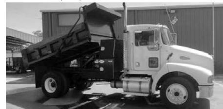
'02 KW T300, Cat 3126 dsl., 250 hp, auto. O.D., spg. susp., S/A, 22.5 tires, steel whls., 33,000 GVW, 12F, 21R, 14' body, std. cab, stk. #2980-T, $24,900.