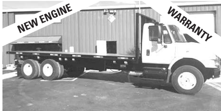
'05 Int'l. 7600, Int'l. DT466 dsl., 285 hp, auto., Hend. susp., tdm., O.D., 22.5 tires, steel whls., 265" WB, 54,000 GVW, 14F, 40R, 400,000 miles, 24"x102" dump bed, stk. #2883-T, $48,900.