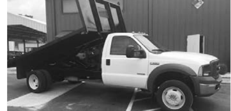
'05 Ford F550 XL, 180,000 miles, Int'l. 6.0 dsl., 325 hp, auto., spg. susp., S/A, 19.5 tires, steel whls., 6F, 13.5R, std. cab, 19,500 GVW, 12'x96" body, good A/C, 4x4, PS, turbo, stk. #2977-T, $17,900.