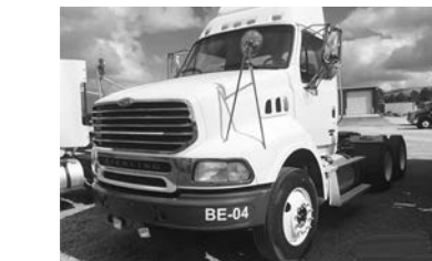
'05 Sterling A9500, 540,000 miles, Mercedes MBE460 dsl., 435 hp, 10 spd. O.D., air ride susp., tdm., eng. brake, 22.5 tires, steel whls., 175" WB, 52,000 GVW, 12F, 40R, std. cab, stk. #2952-T, $13,900.