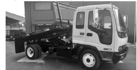
'04 GMC WT5500, 194,000 miles, 215 hp, Isuzu 7.8, auto., spg. susp., 19.5 tires, 6F, 13.5R, 19,500 GVW, 12'x102", A/C, cruise, stk. #2935-T, $19,900.