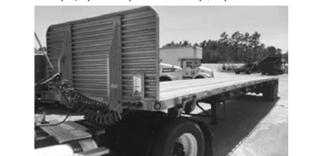
'07 Utility 48'x102", fixed neck, spg. susp., alum. floor, 22.5 tires, steel whls., tdm., sldg. axle, stk. #2983-T, $14,900.