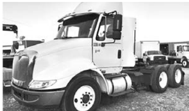
'03 Int'l. 8600, Cum. ISM dsl., 380 hp, 10 spd. O.D., air ride susp., tdm., 3.90 ratio, 22.5 tires, steel whls., 165" WB, 52,000 GVW, 12F, 40R, 480,000 miles, stk. #2819-T, $18,900.