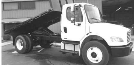
'10 FTL Business Class M2 106, Cum. ISB dsl., 240 hp, auto., spg. susp., S/A, 5.13 ratio, 22.5 tires, 26,000 GVW, 8.5F, 17.5R, new 16"x102" flat dump, 210,000 miles, hitch, under CDL, stk. #2917-T, $38,900.