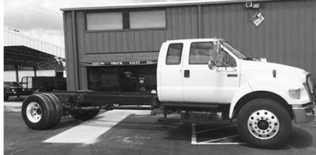
'08 Ford F650 SD, 261,000 miles, Cum. ISB dsl., 280 hp, auto. O.D., 4.88 ratio, spg. susp., S/A, 22.5 tires, alum. whls., 33,000 GVW, 12F, 21R, std. cab, A/C exc., pwr. locks, stk. #2943-T, $18,900.