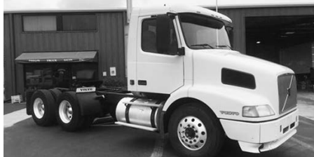
'03 Volvo VNM64200, 245,000 miles, Volvo VED12 dsl., 380 hp, 10 spd. O.D., eng. brake, 4.11 ratio, air ride susp., tdm., 22.5 tires, alum. O.S. whl., 175" WB, 52,000 GVW, 12F, 40R, stk. #2999-T, $21,900.