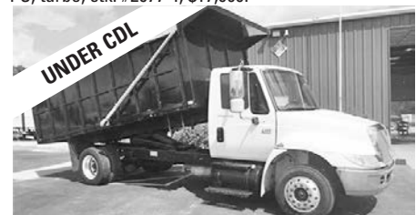
'03 Int'l. 4300 SBA, Int'l. DT466 dsl., 210 hp, 318,000 miles, 6 spd. O.D., spg. susp., S/A, 19.5 tires, alum. O.S. whls., 25,500 GVW, 8F, 17.5R, 16' steel body, stk. #2969-T, $28,900.