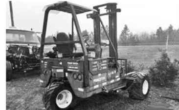
'05 Princeton PB70, 7000 lb. load cap., 1797 hrs., 3WD, max lift ht 12', seated rider, dsl., rubber tires, stk. #2940-T, $19,900.